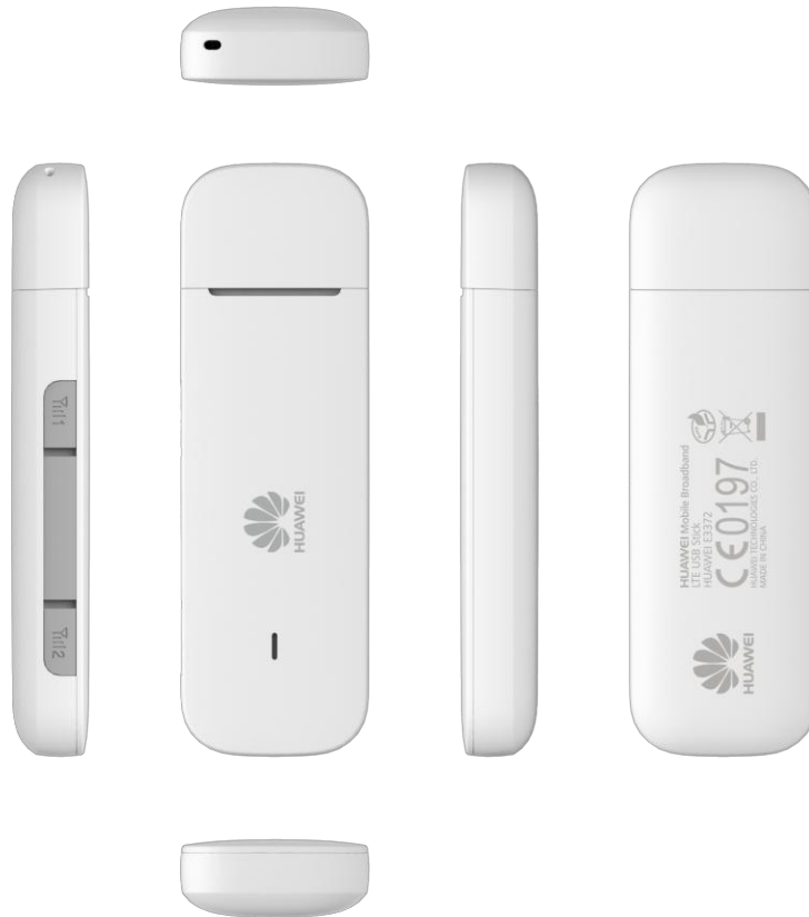
Figure 1-1 E3372s-153 profile